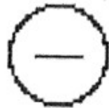
Circle Bar Inside