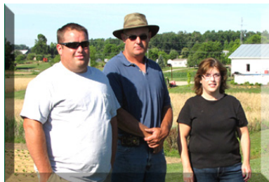
The Turners, of McLean County