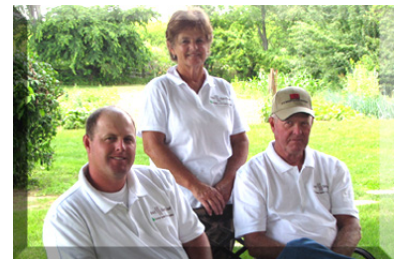
Bach Family, of Bath County