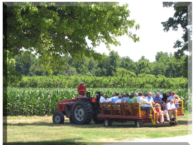
Photos: (top) KADB and KAFC members during joint meeting of both boards. (above) Both boards tour Reed's Orchard in Daviess County.

Of the 10 private members appointed by the Governor, two may be officers from a commercial lending institution, one may be an officer from a farm credit association, one may be an agricultural economist, one shall be a tobacco farmer, one shall be a cash grain farmer, one shall be a livestock farmer, one shall be a dairy farmer, one shall be a horticultural farmer, and one shall be from the equine industry.