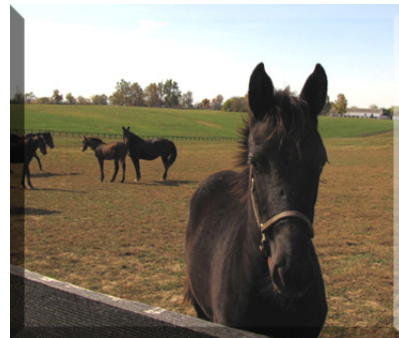
Saddlebred horses in Bourbon County

W. Brent Woodrum was approved for $22,500 in multi-county funds to purchase equipment and materials for a multi-county fallen animal composting service site in Casey County.