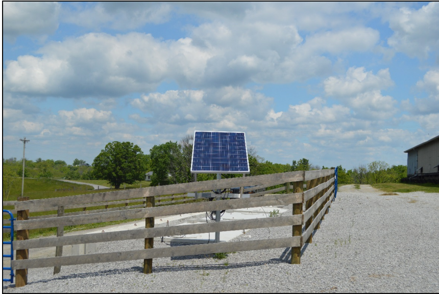
A solar powered pump installed in a water harvesting system.

Definition: The practice of using a solar panel and pump to distribute water within a water harvesting system. This practice includes the infrastructure necessary to direct, store, and distribute water. This practice is supported by NRCS practice standard codes 570: Stormwater Runoff Control, 614: Watering Facility, and 636: Water Harvesting Catchment. This practice is eligible for cost share through CAIP and EQIP in Kentucky.